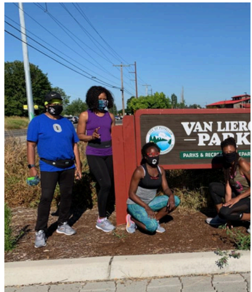
All photos courtesy of ForeverGreen Trails and the Puyallup Watershed Initiative